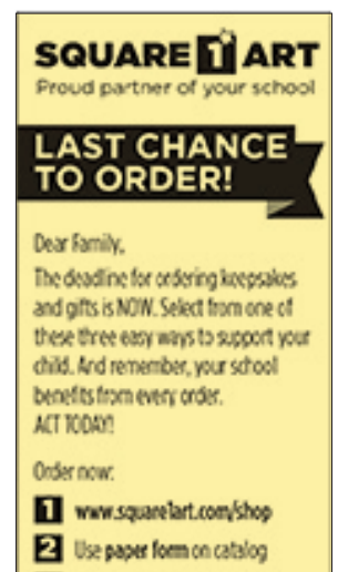
Last Chance Flyer