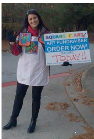
Car Pool Line