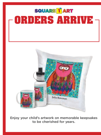
Orders Arrive Poster