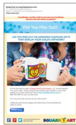
Miss Out Email