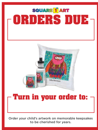
Orders Due Poster